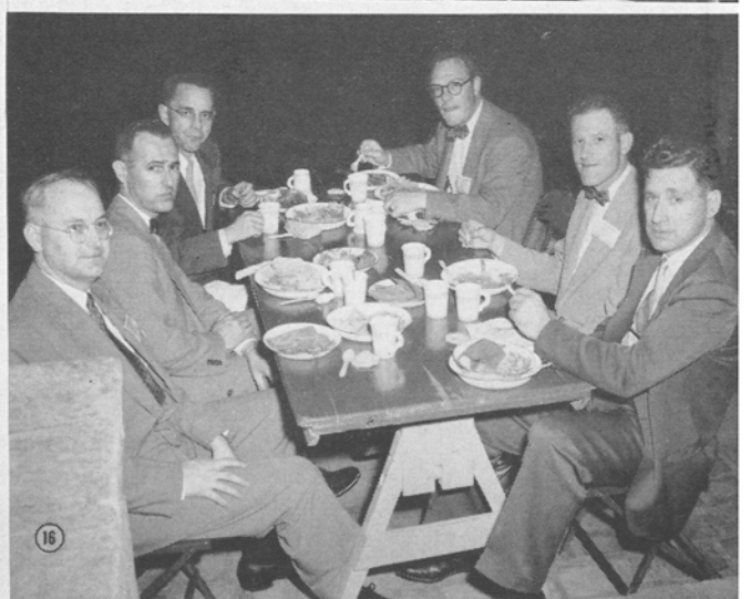
captions of above pictures)